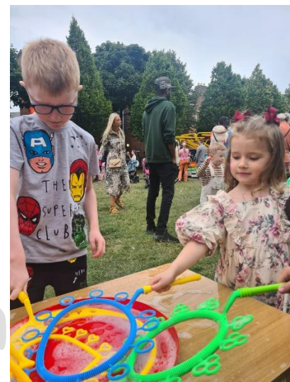
Children enjoying the various activities through the day.